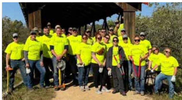
Vernon Electric and Dairyland Power Co-op employees take a break from their labor for a group photo by one of the covered bridges at the Kickapoo Valley Reserve.

The day demonstrates "Concern for Community" which is one of Vernon Electric's guiding principles for the cooperative. This demonstration of Vernon Electric's principle didn't go unnoticed, receiving praise from the Kickapoo Valley Reserve.