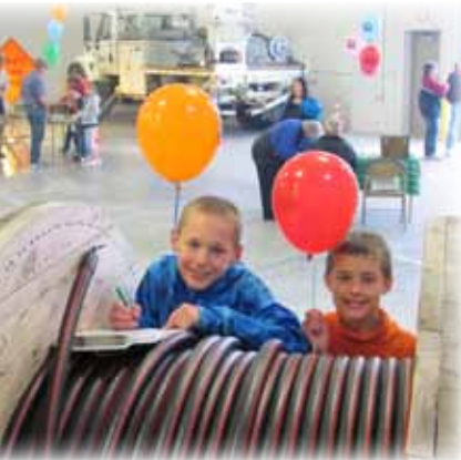
Two boys guess the length of a wire reel at one of the games

Thank you for being a member of Vernon Electric Cooperative. Our employees take great pride in providing you excellent service. Your business is appreciated.