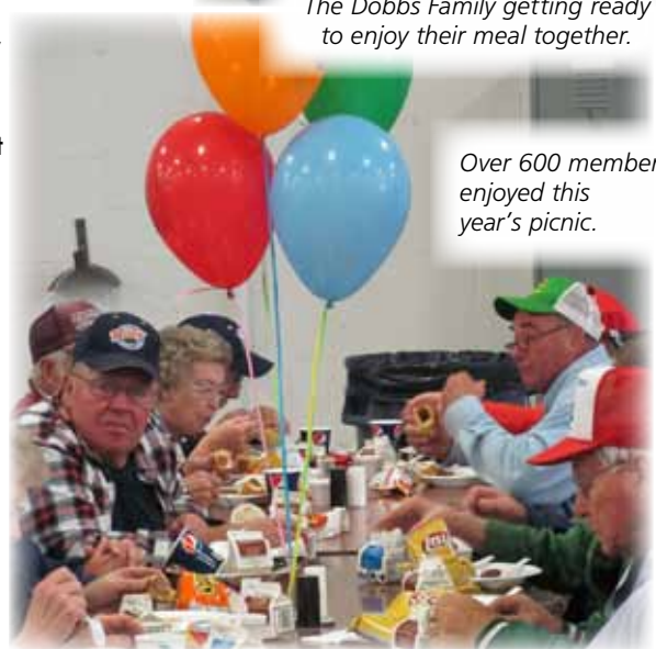
Over 600 members enjoyed this year's picnic.