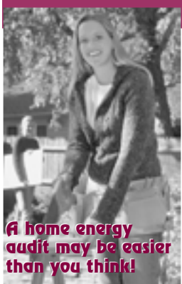
A home energy audit may be easier than you think!